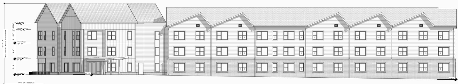
East 2 1/8" = 1'-0"