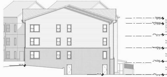
North 3 1/8" = 1'-0"