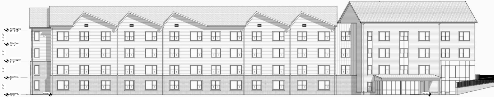
West 2 1/8" = 1'-0"