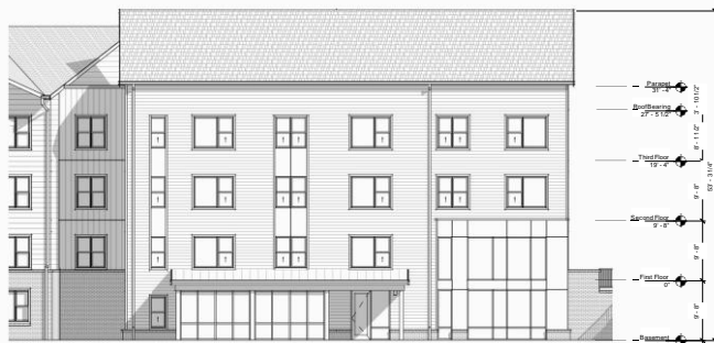
Southwest 3 1/8" = 1'-0"