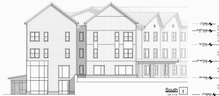
South 1 1/8" = 1'-0"