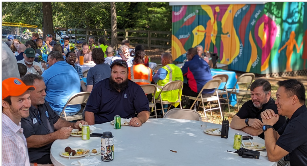
Town employees ate the heck out of fantastic food from Mediterranean Deli at Mediterranean Monday at Hargraves Center. For more feature food events, see p2.